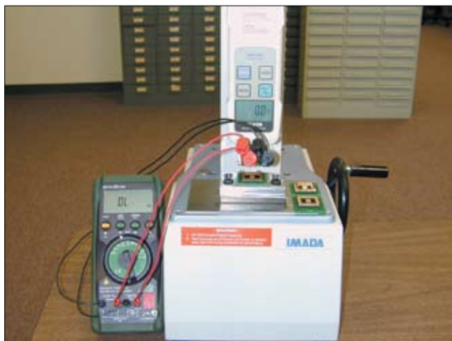
Giga-snaP testing setup: Insertion / Extraction forces Fig. A

Our patent pending epoxy over-mold method for Giga-snaP uses FR4 substrate with pins held by a thin ring of epoxy. The cured epoxy ring effectively seals the pin for optimum solderability. This solves the PCB fracturing problem and warping caused by press fitting into a substrate. This also allows us to use FR4 rather than plastic, thus avoiding CTE mismatch.