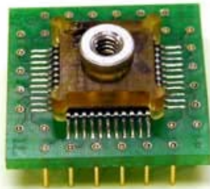
Figure 2: Alignment block on IC