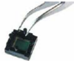
Figure 3: Tweezers with SG-BGA socket

A small tweezers is recommended for insertion/extraction of ICs having a body size of 7x7mm or smaller. Figure 3 shows a typical small tweezers with a GHz BGA socket.